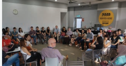
Cuppa Coffee with Principal