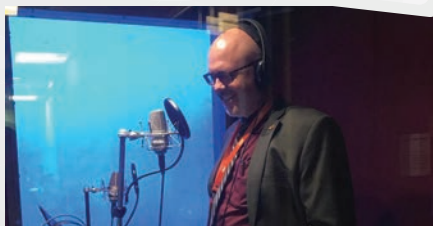
Recording at Astro for Open Day