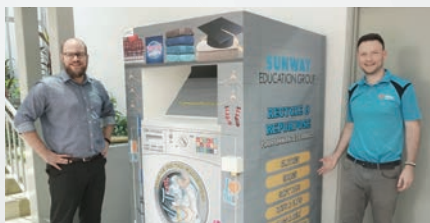
Recycle & Repurpose Drop Box