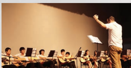
Music Class Performance