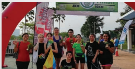
Green Team @ Good Earth Run