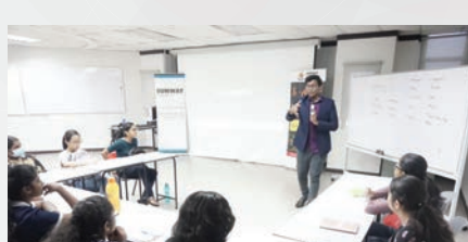
SNaPS™ Workshop Ipoh