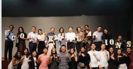
IB Appreciation Dinner