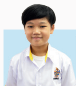
LIM WEI CHEN MUSIC SCHOLARSHIP