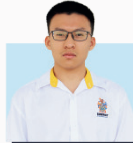
TAN ZAN XI IBDP ENTRANCE SCHOLARSHIP