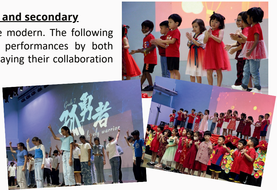
Kindergarten, Grade 1, Grade 7

The traditional was succeeded by the modern. The following acts featured several inspiring class performances by both primary and secondary students, displaying their collaboration and dedication. Together, they delivered a dynamic and coordinated performance, reflecting the cooperative spirit of our school students.