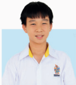
CHONG YANG YANG SPORTS SCHOLARSHIP