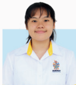
KUAN JING XUEN MUSIC SCHOLARSHIP