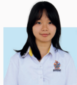
CHONG YIH YEE MUSIC SCHOLARSHIP